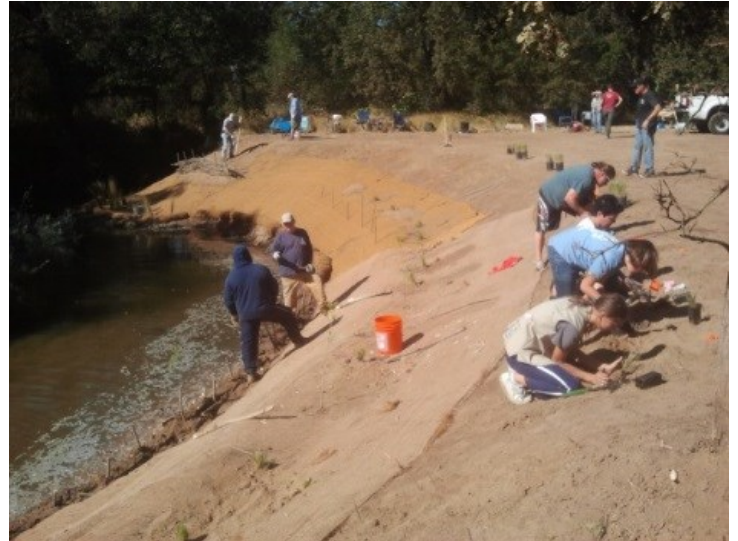
(After – Restoration)

Join your neighbors and friends to plant native trees and plants. These bio-engineering techniques stabilize the creek banks and repair erosion from flooding and loss of heritage oaks. This natural method restores habitat for wildlife. This is a great educational opportunity and a chance to work together and socialize, children and seniors encouraged to come.