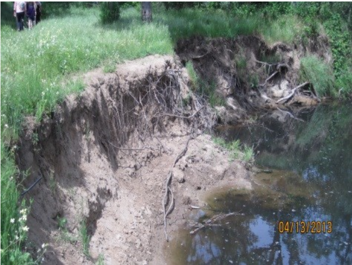
(Before – Bad Erosion)